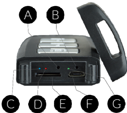
A - Restore Factory Configuration button B - Reset button C - blue LED (WiFi)