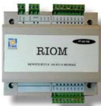
PT811 I / O Module

PT908 is an additional module to be connected to PT811 to convert the 8 logic outputs in 8 relay outputs to directly control power loads up to 5 A.