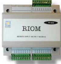
PT908 Additional module Relay